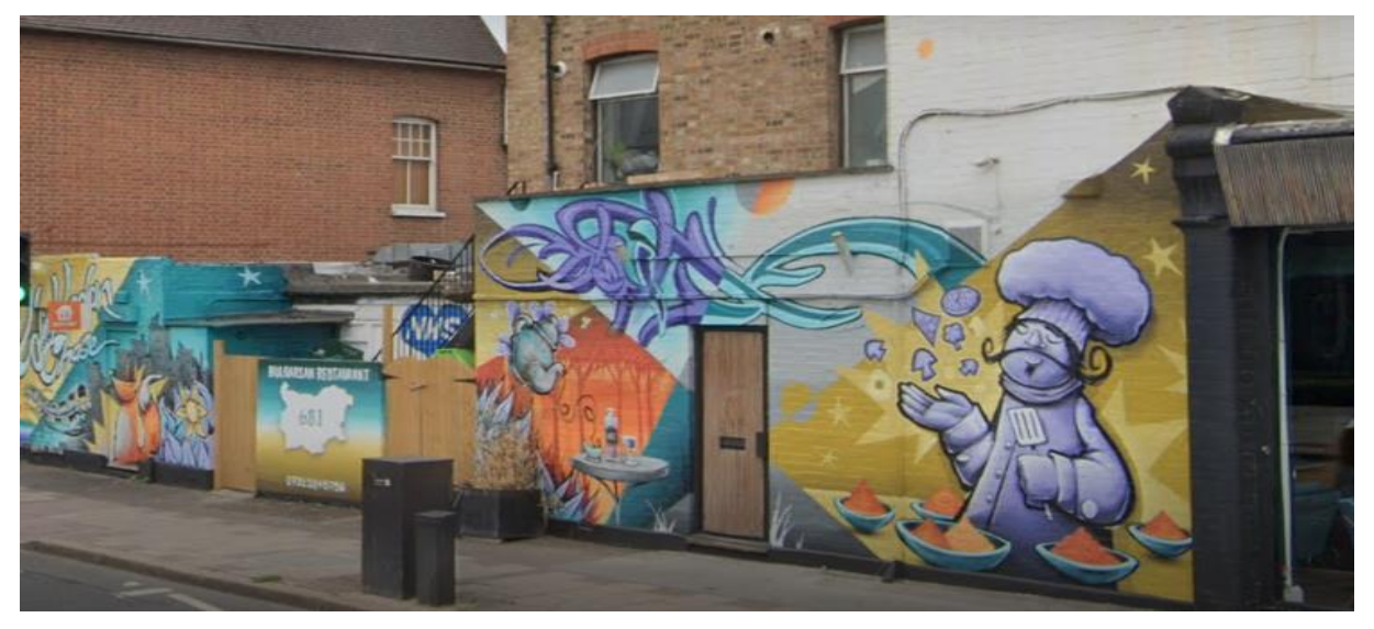
Before-Advertisement of restaurant

Officers visited the property and discussed with the owner and staff of the restaurant, after negotiations, it was moved via informal enforcement action, the results are below.